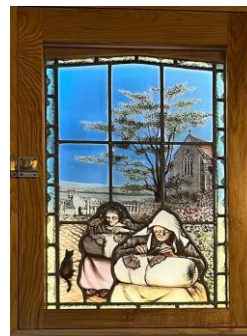
Stained glass detail