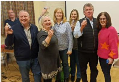
The victors celebrate with prizes of inestimable worth!