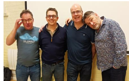
The organisers still standing (just) – same time next year, lads?