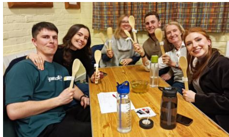
The not so victorious play upon their ladles