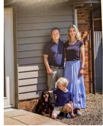
All of the Hoppertons