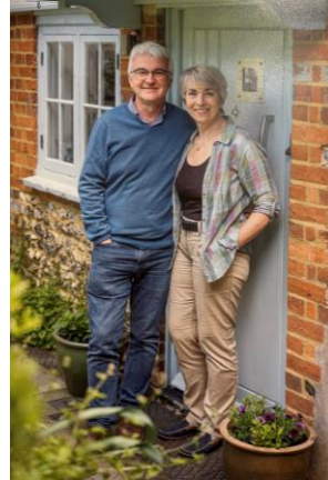
Two-thirds of the newsletter team